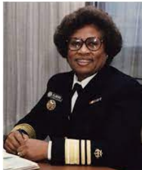
Joycelyn Elders, MD Former Surgeon General of the United States